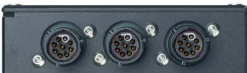
3 x 9W DDAS